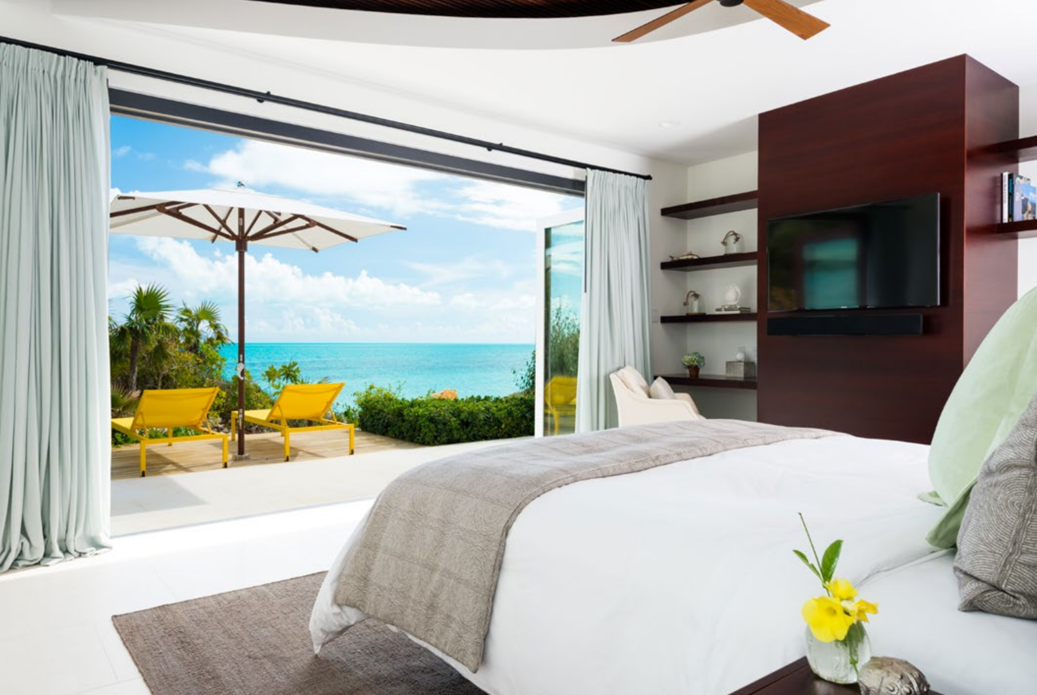
The Master Suite's exquisite interior opens to an oceanfront terrace with caicos stone steps leading down to the private sandy cove.