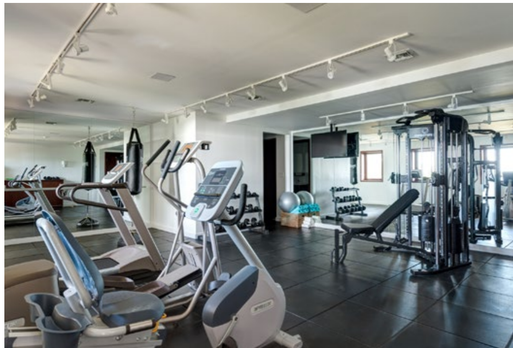
For fun: Sunset-facing fire-pit pavilion and LED lit hot tub, 13 seat screening room, fully equipped gym, tennis court, games room and feature wine cellar. The home has a fully integrated smart control system and top of the line audio-visual system.