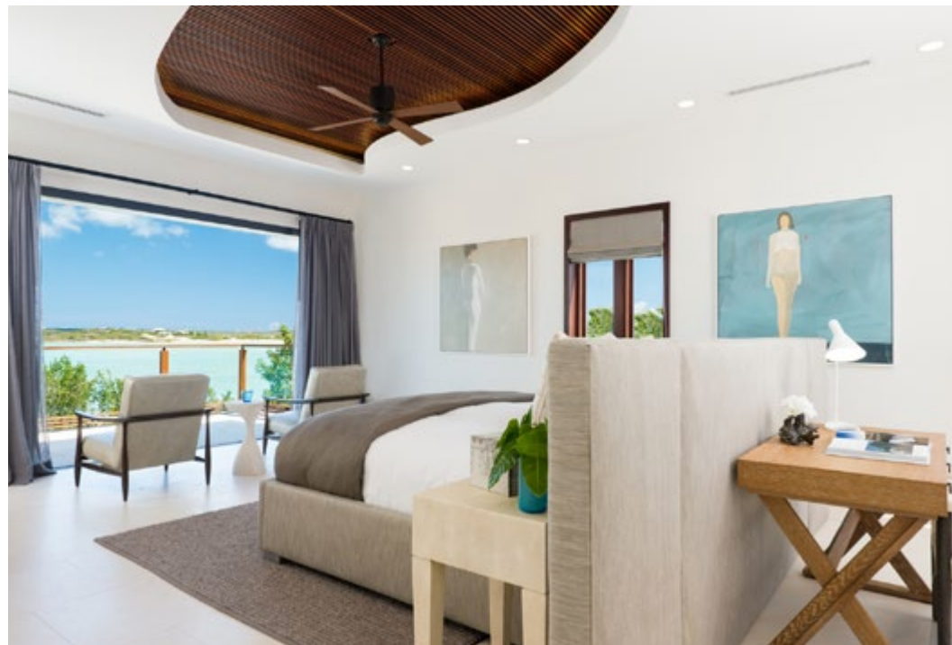
The East Wing bedrooms provide guests and family with their own private experience and feature custom furnishings and showpiece bathrooms.