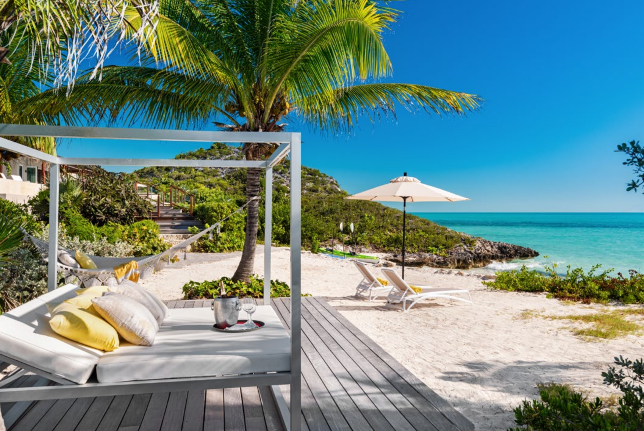
The newly completed resort-style compound provides an opportunity for immediate gratification to its owners.