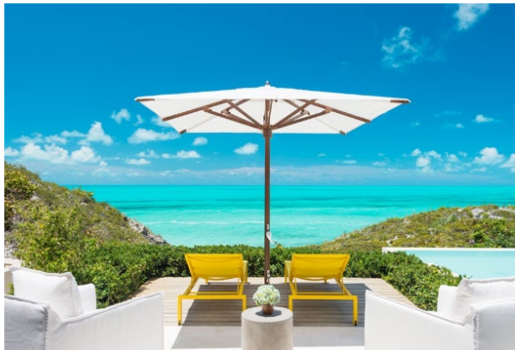
The Master Suite also boasts a private outdoor bath and shower garden amidst lush landscaping in addition to spacious interior dressing, walk-in closet and bath areas.