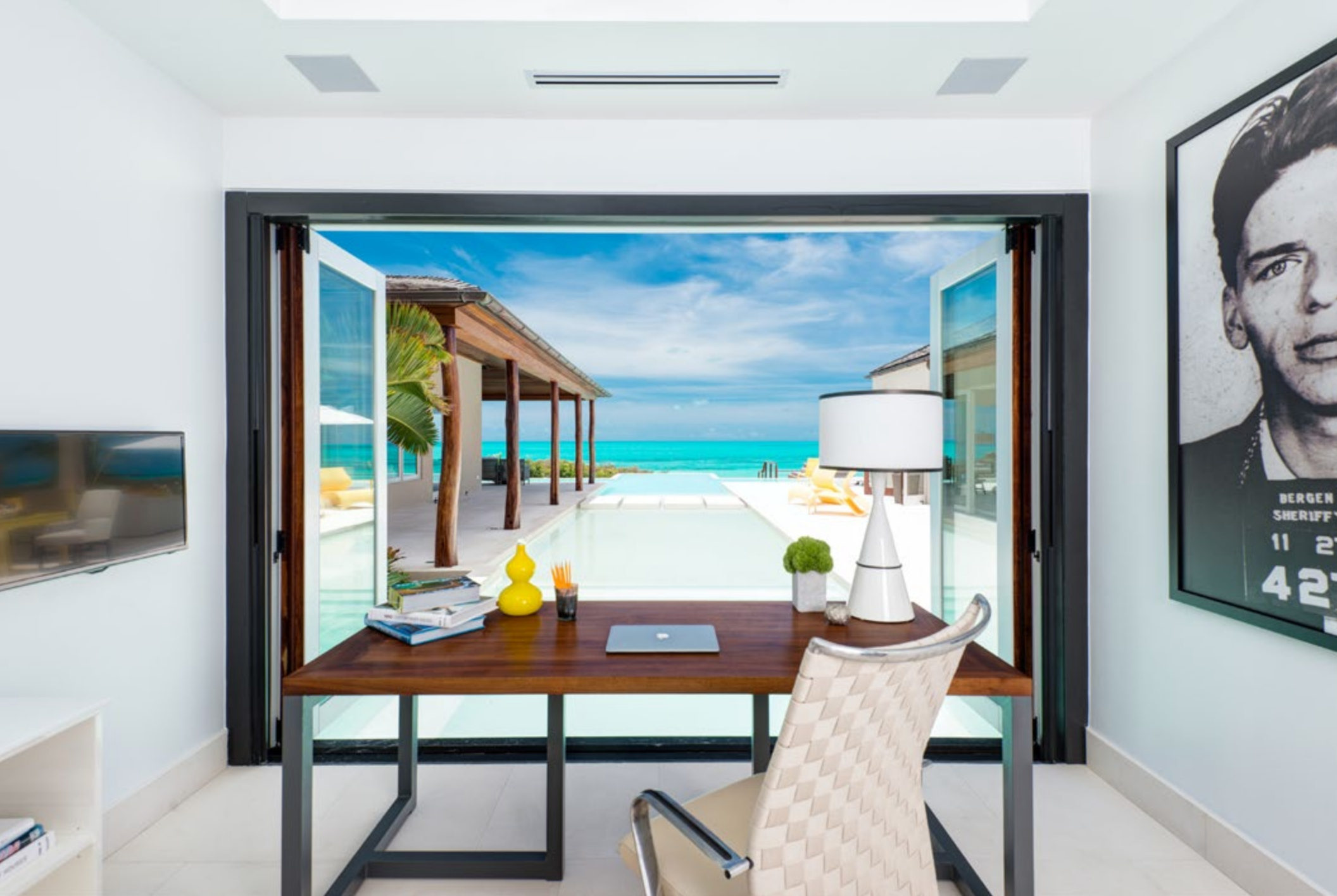
The trophy ocean-facing office looks down the wrap-around pool with stepping stones leading across to multiple entertaining spaces and the guest wing.